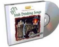
Irish Drinking Songs CD Price: $7.95