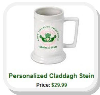
Personalized Claddagh Stein

May your glass be ever full. May the roof over your head be always strong. And may your be in heaven half an hour before the devil knows your dead.