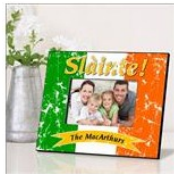
Personalized Pride of the Irish Picture Frame