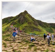
Join a Group Tour