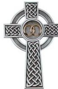
Knotted Celtic Wedding/Anniversary Wall Cross Price: $49.95