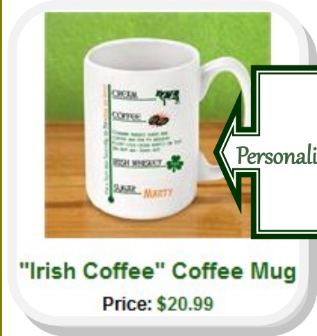
"Irish Coffee" Coffee Mug Price: $20.99