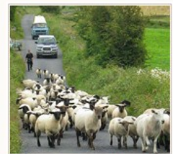
Take a Driving Vacation