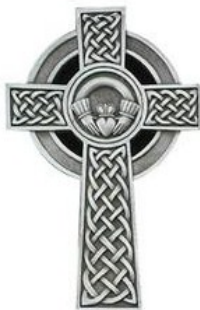
Knotted Celtic Wall Cross Price: $45.95