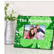
Personalized Jolly Green Clover Picture Frame