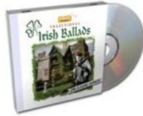
Irish Ballads CD Price: $7.95