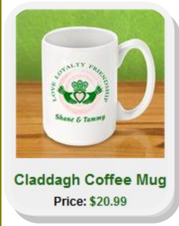
Claddagh Coffee Mug Price: $20.99