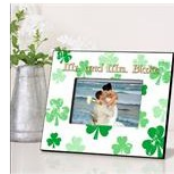
Personalized Raining Clovers Picture Frame