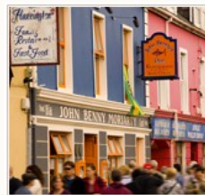
Create Your Own Vacation