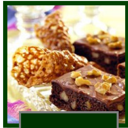
Irish Coffee Brownies