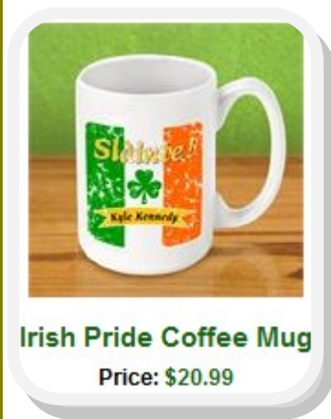
Irish Pride Coffee Mug Price: $20.99

Shop Online for personalized Irish Gifts