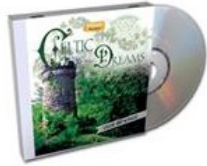
Celtic Dreams CD Price: $11.95